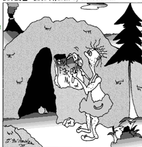
Cavemen had a hard time putting up their building permits.