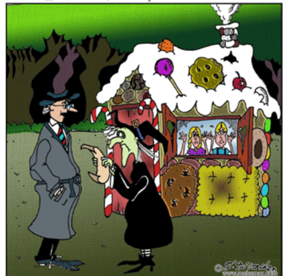
"Sorry, but you're in violation of building codes. You can only use lo-cal hi-fiber wood here."